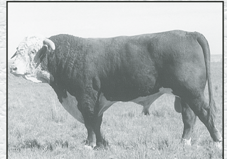
GH Buck Domino 34K